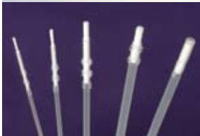
The FiberCare cleaning sticks are packaged in convenient cardboard boxes with a window that allows users to confirm size and quantity. Everything fits easily into tool kits